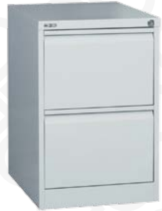
GFGA2 2 Drawer 730H x 460W x 620D Shipping details: 24kgs/ 0.21 m 3