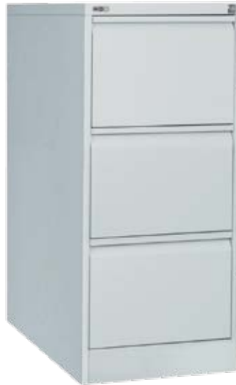
GFGA3 3 Drawer 1016H x 460W x 620D Shipping details: 32kgs/ 0.29 m 3