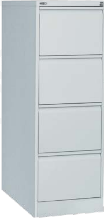
GFGA4 4 Drawer 1321H x 460W x 620D Shipping details: 42kgs/ 0.38 m 3

Designed and manufactured to meet British standards. Quality, customer service and competitive prices are trademarks of the Go Steel Range