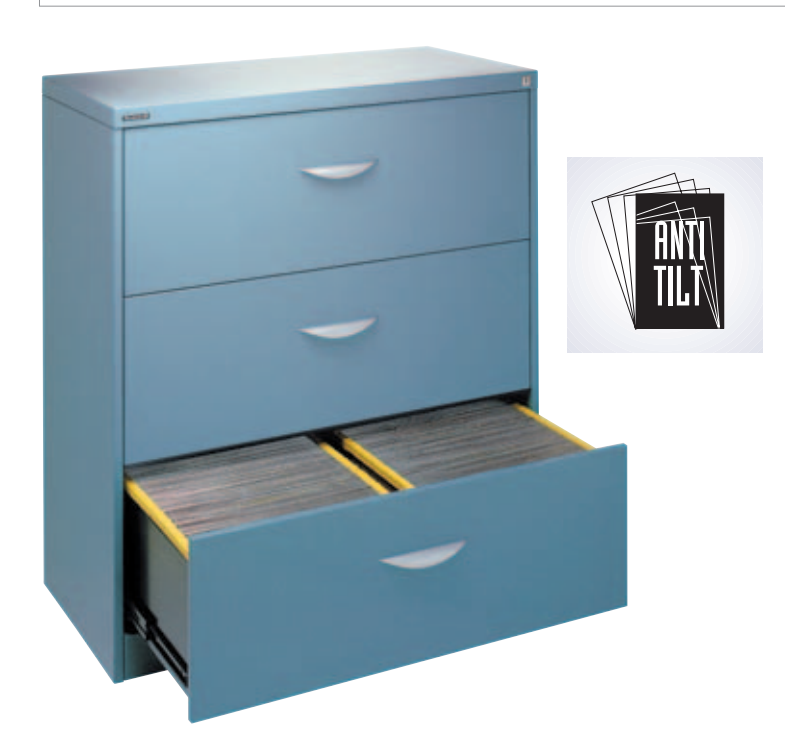
These multi-functional storage units suit personal or communal file access and provide additional work surfaces or work area partitions.