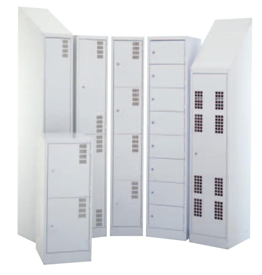
Brownbuilt manufactures Australia's largest range of metal lockers which combine strength, quality and flexibility.