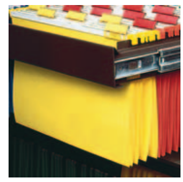
ROLL-OUT SUSPENSION FILING

Advancements in information technology have made office filing more complex, requiring individual storage solutions. Brownbuilt has developed a wide range of filing systems that facilitate tailored filing or records management solutions for personal storage through to centralised communal storage.