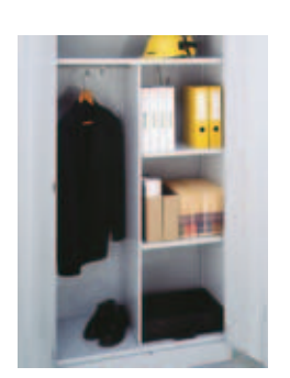
COMBINATION WARDROBE UNIT

Brownbuilt Swing Door Cupboards have been developed to carry anything from office stationery to light machinery parts and tools. They can be configured as shelving units, multi-media storage units, wardrobes or as combinations. The contemporary exterior design features high quality contoured alloy door handles for ease of use and individual style.