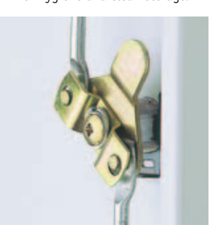
3-POINT LOCKING MECHANISM

Optional sloping tops at 30° and 45° for hygiene and clean storage.