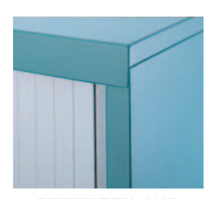
STRENGTH AND STABILITY

Waratah cupboards are manufactured with a high quality metal construction for strength and durability. Welded support channels at the top and bottom of the cupboard, with bolted internal uprights, provide superior carcass rigidity for high load capacity storage.