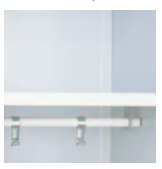
HAT SHELF/COAT RAIL/COAT HOOK

Comprises a hat shelf with full width coat rail and sliding coat hooks.