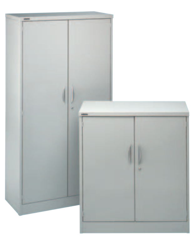
An adaptable and economical answer to multi-purpose storage.

Security is a key design issue with metal reinforced doors, welded internal door hinges and a keyactivated 3-point locking system.