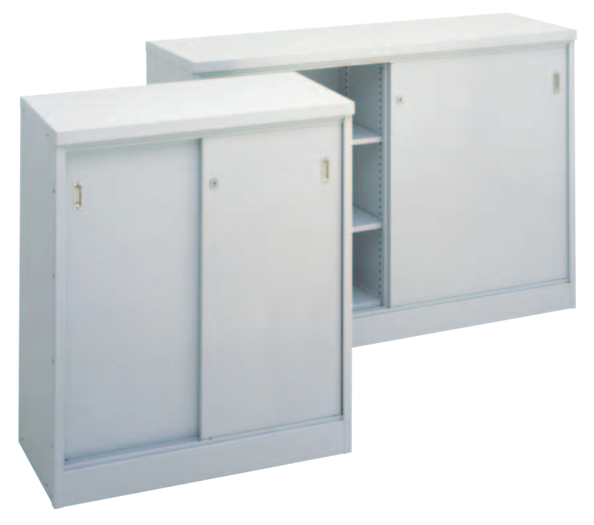
The simple solution for tough, cost effective and reliable storage in areas where access space is restricted.

Brownbuilt sliding door cupboards have been proven performers in organisations of all sizes providing secure shelf-based storage and low-cost additional work surfaces.