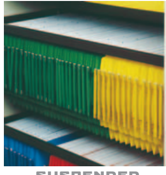
SUSPENDED LATERAL FILING