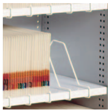
SHELF FILE RACK DIVIDER