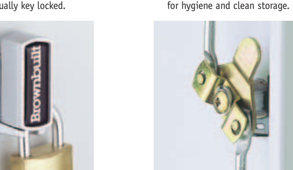
LATCHLOCK WITH PADLOCK FACILITY

Locker compartments can be individually key locked.